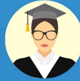
Recipient of Lifetime Achievement Award